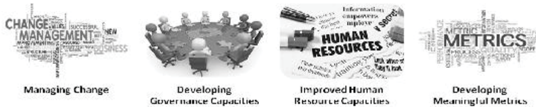
Figure 2. Essential Dimensions of a Tactical Tourism Planning Approach