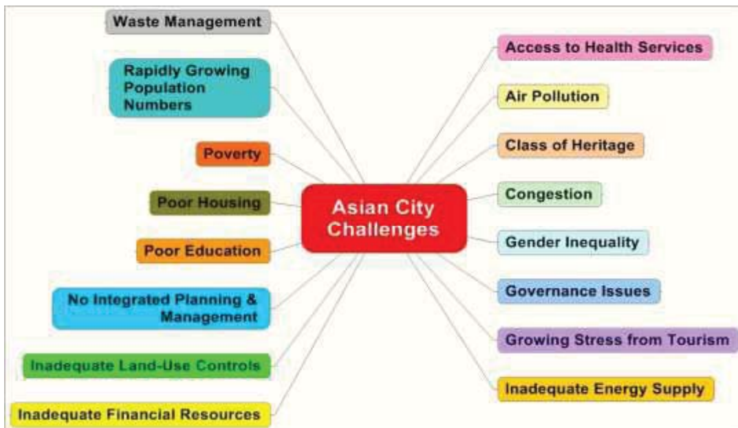
Figure 1 Asian Metropolitan Challenges

changes, a lack of stakeholder agreement and at times non-existent regulatory structures. The overall Asian challenges can be seen in Figure 1, adapted from a previous iteration of the authors (Horayangkura et al., 2012).